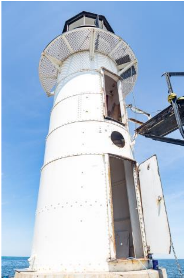
Prior to NCP SiloxoSheild 2K