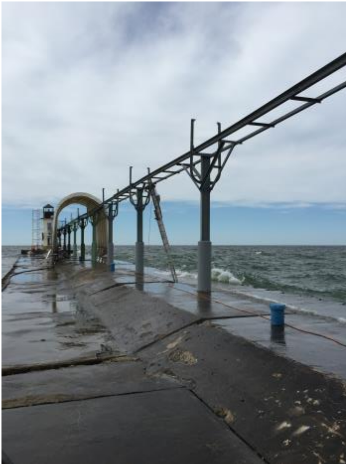
Prior to NCP SiloxoSheild 2K