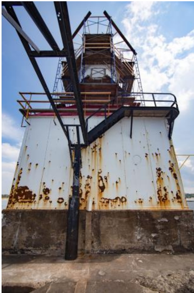
Prior to NCP SiloxoShield 2K