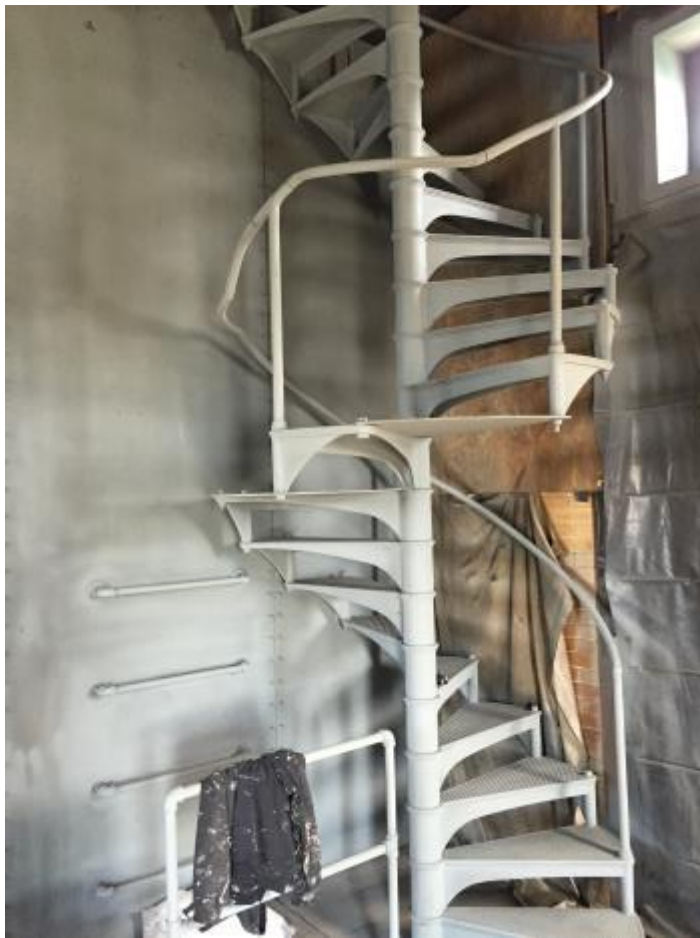
Inside Staircase prior NCP SiloxoSheild 2K